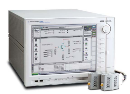
Agilent B1500A Semiconductor Device Analyzer www.agilent.com/find/B1500A

Agilent B2961A/B2962A 6.5 Digit Low Noise Power Source www.agilent.com/find/ precisionSOURCE