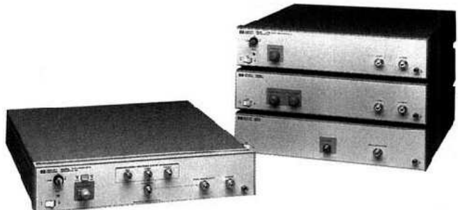
HP 83420A, 83421A, 83422A, 83423A