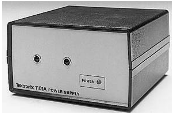
1101A Power Supply.

AC or DC coupling selection is available on the P6201 and P6202A FET Probes. When AC coupled, the DC voltage component is blocked, allowing viewing of superimposed signals.