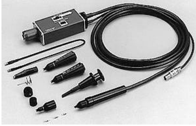
P6201 - P6201 with Accessories.