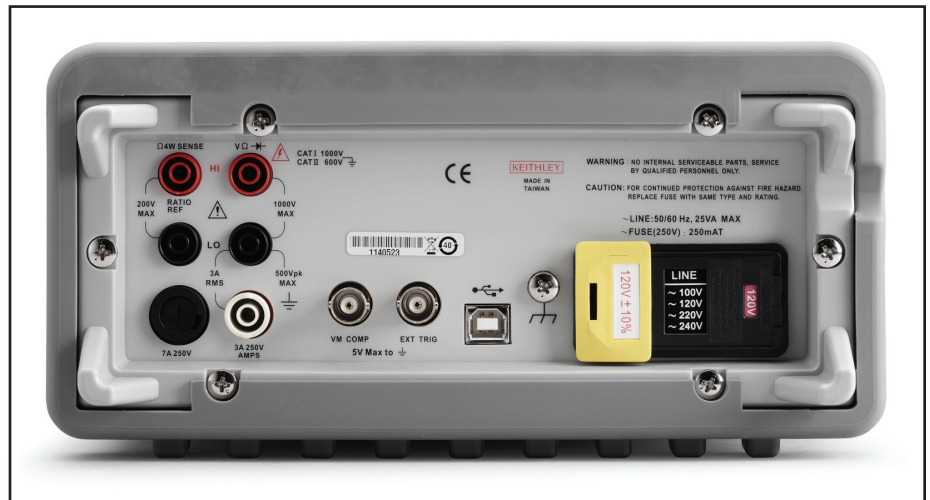
Model 2100 rear panel

AC CMRR: 70dB (for 1kΩ unbalance LO lead). POWER SUPPLY: 120V/220V/240V. POWER LINE FREQUENCY: 50/60Hz auto detected. POWER CONSUMPTION: 25VA max. DIGITAL I/O INTERFACE: USB-compatible Type B connection. ENVIRONMENT: For indoor use only. OPERATING TEMPERATURE: 5° to 40°C. OPERATING HUMIDITY: Maximum relative humidity 80% for temperature up to 31°C, decreasing linearly to 50% relative humidity at 40°C. STORAGE TEMPERATURE: –25° to 65°C. OPERATING ALTITUDE: Up to 2000m above sea level. BENCH DIMENSIONS (with handles and feet): 112mm high × 256mm wide × 375mm deep (4.4 in. × 10.1 in. × 14.75 in.). WEIGHT: 4.1kg (9 lbs.). SAFETY: Conforms to European Union Directive 73/23/ECC, EN61010-1. EMC: Conforms to European Union Directive 89/336/EEC, EN61326-1. WARRANTY: One year.